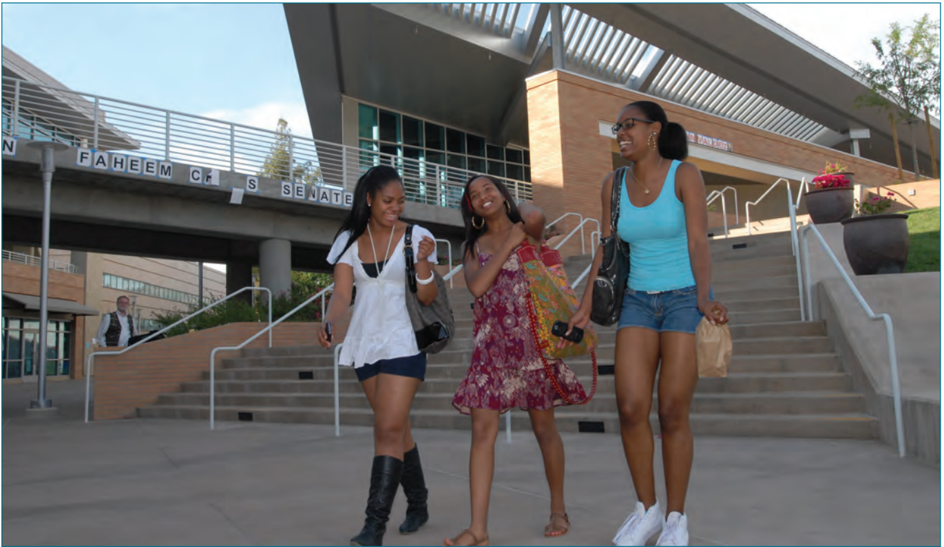
University of California at Riverside has a diverse student population and is focused on the mission of making sure they graduate and succeed in the world.