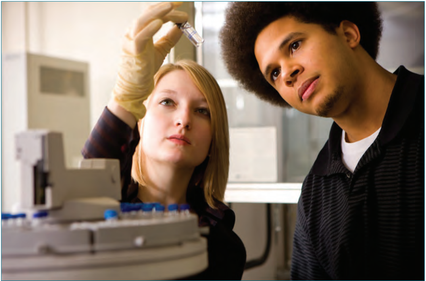
Students perform experiments in the Pharmacology laboratory at University at Buffalo. The “Finish in 4” program guarantees graduation for students who agree to keep their grades up and meet regularly with advisers.

people of the state gave us this land to educate them. We are committed to serving our population in the community and providing support to students.” 37