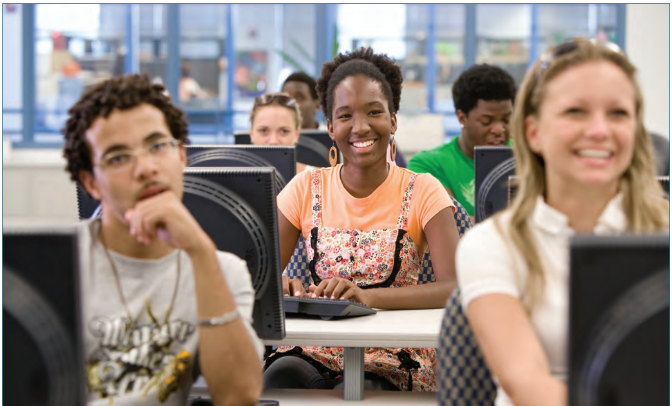
The University of Central Florida has ten regional campuses across central Florida to give students flexibility in finishing their bachelor’s or graduate degrees. Here, students sit in class at UCF Ocala.

In 2011, Arizona State officials tested a new adaptive learning technology in an effort to personalize the learning experience and improve student success. The system, created by the start-up company Knewton, builds profiles of each student as they progress through lessons on a computer screen and delivers the next question based on their previous answers or recommends video tutorials when they get stuck on a problem. Students still attend classes scheduled at a fixed time, but instead of being lectured they work alone at a computer and at their own pace, as an instructor roams the room with a class roster that shows which students are on-track (in green) or off-track (in red).