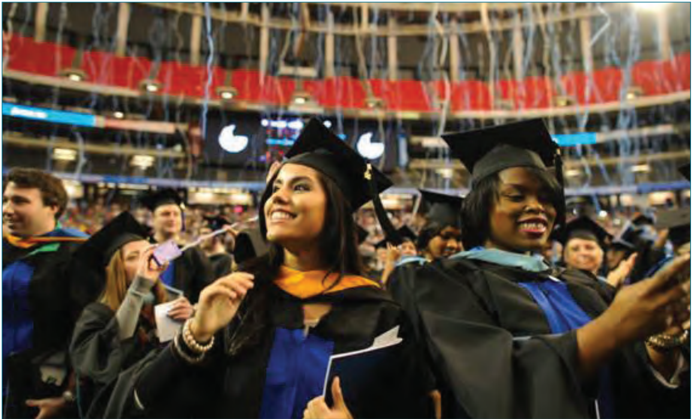
Georgia State, with one of the most diverse student bodies in the country, enrolls over 32,000 students in downtown Atlanta.