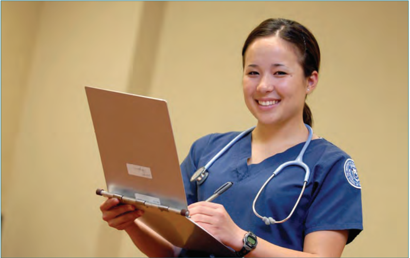
University of Texas at Arlington's online RN-to-BSN program is so popular it now operates as the nation's largest public university nursing school.

helps public universities build online courses and recruit students. By assisting the Arlington campus in establishing new online programs in high-volume professional areas, such as teaching and nursing, the university's enrollment grew substantially. Today, 42 percent of Arlington students take at least one class online, and 27 percent of them are enrolled exclusively online. About 60 percent of the online enrollment is managed by Academic Partnerships (with the remaining courses overseen by the university). 16